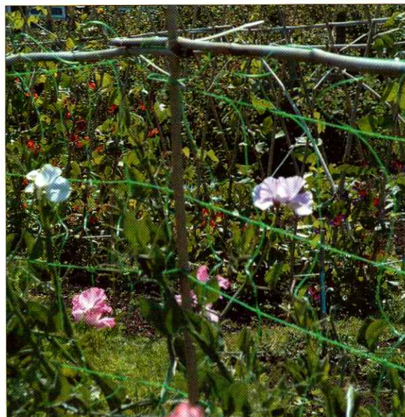
Sweet Peas at the Marland Allotments